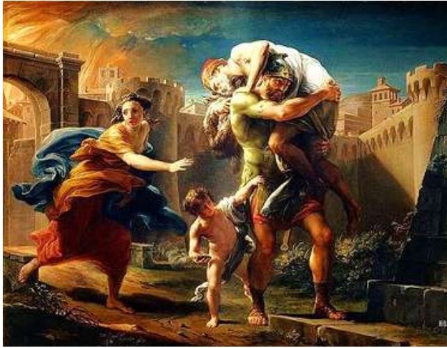
(Artist: Pompeo Batoni Date: 1708-87)

O mother earth! Why can't we witness darkness that makes the air full of treachery and ruse.