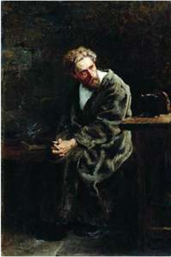
(Artist: Vladimir Makovsky Date: 1846-1920)

O mother earth! Why can't we witness darkness that attempts to confine our souls in its empty and cold chamber.