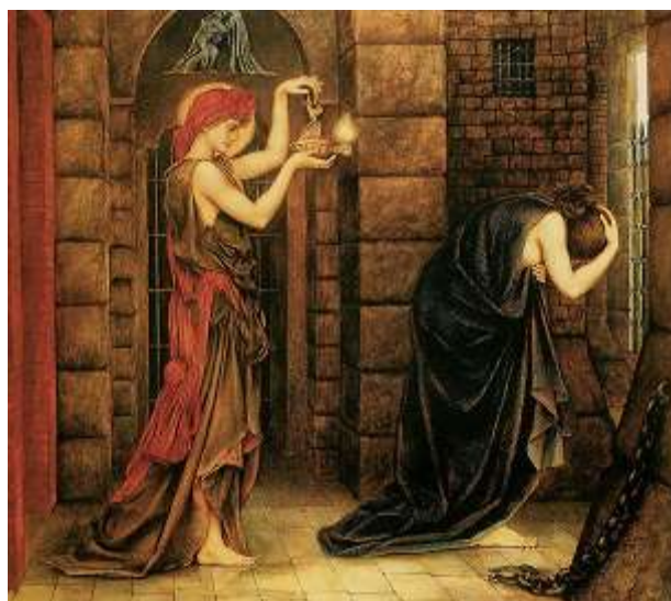
(Artist: Evelyn De Morgan Date: 1855-1919)

O mother earth! Why can't we witness darkness that attempts to confine our souls in its empty and cold chamber.